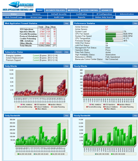
The Barracuda Web Application Firewall monitors and tracks common application attacks, performance statistics and bandwidth usage.

To minimize ongoing administration associated with protecting Web sites against application vulnerabilities, the Barracuda Web Application Firewall automatically receives Energize Updates with the latest policy, security and attack definitions. In addition to the comprehensive security benefits, there are also application delivery capabilities such as SSL offloading, SSL acceleration and load balancing. These capabilities are designed to improve the performance, scalability, and manageability of today's most demanding data center infrastructures.